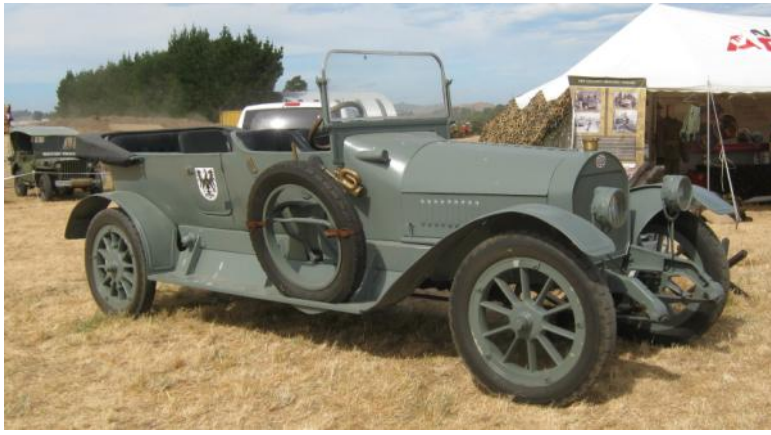
WW I German Staff Car