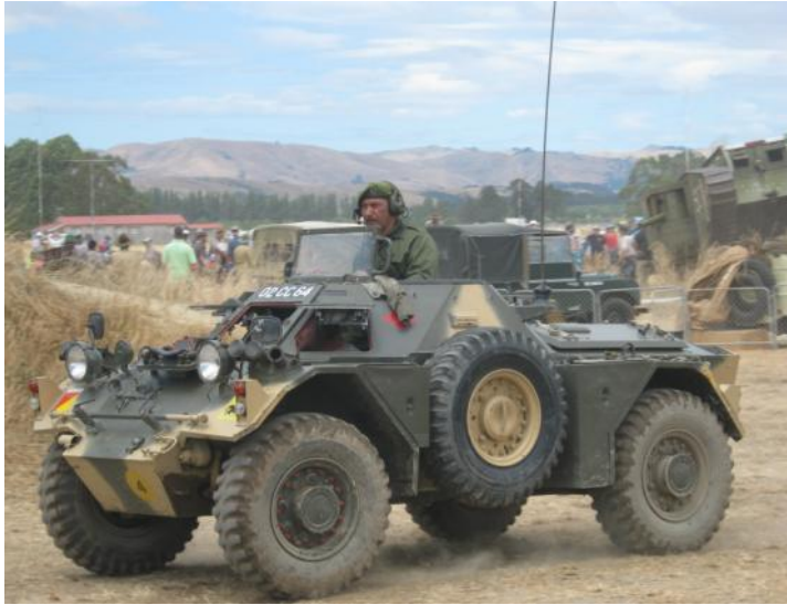
Ferret Scout Car