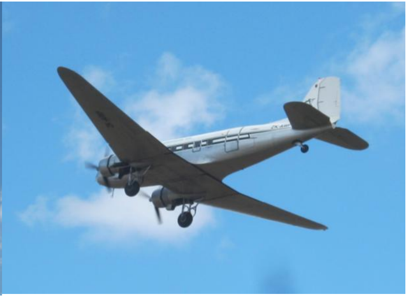
DC 3 Dakota