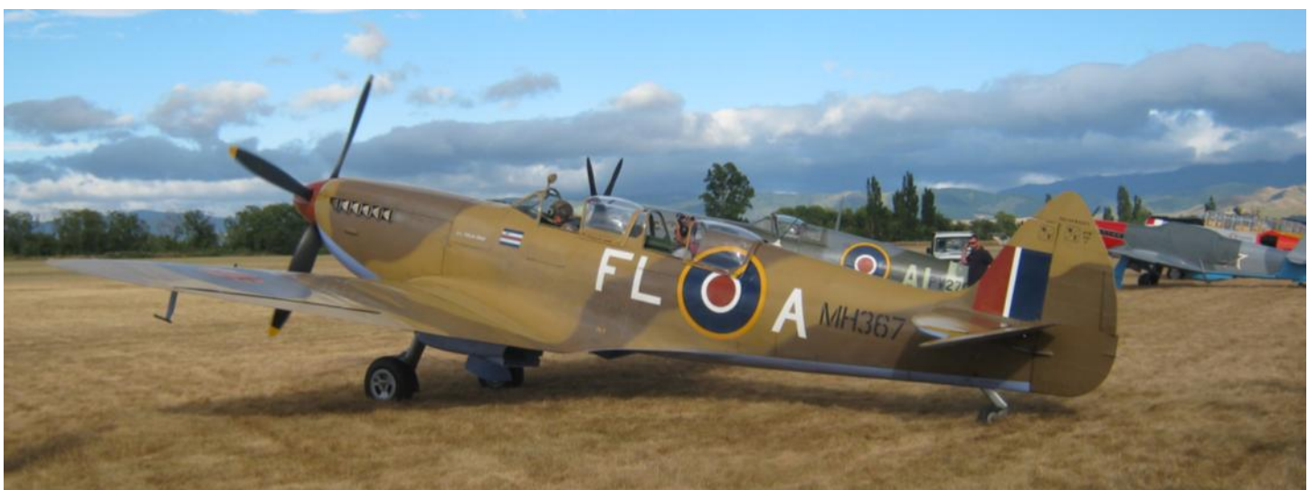
Spitfire Tr IX