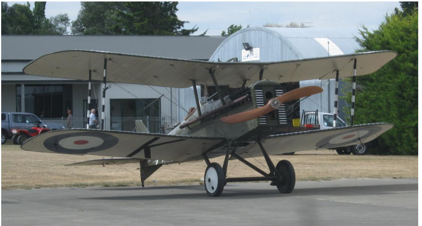
Royal Aircraft Factory SE5a