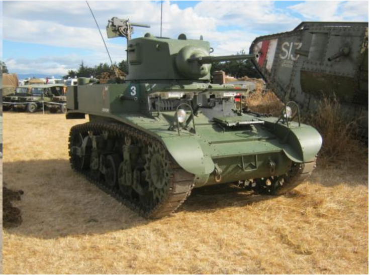
Stuart Light Tank