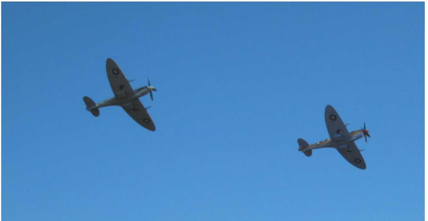
A pair of Spitfires