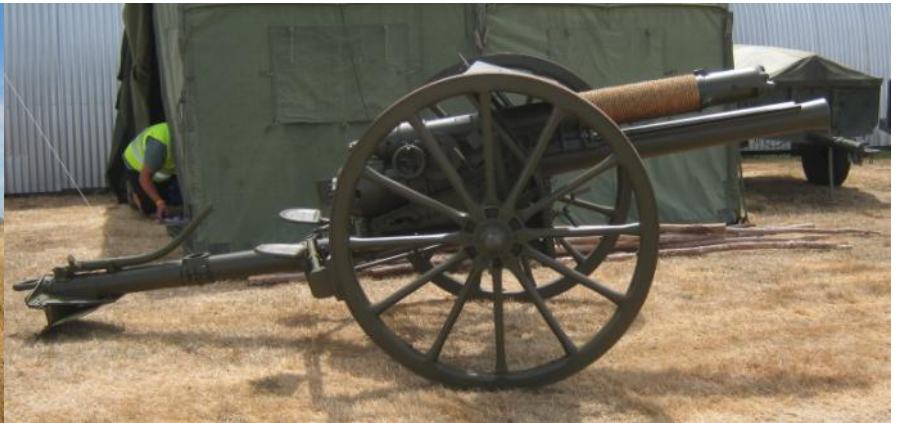
18Lb QF Field Gun