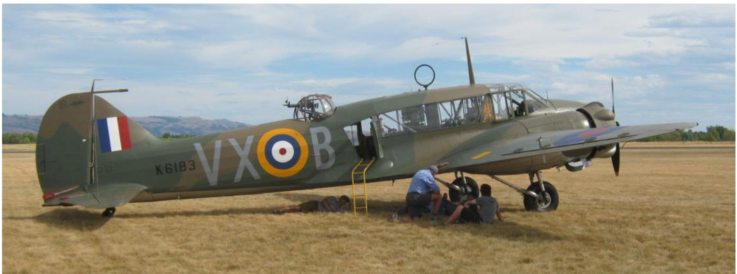
Avro Anson Mk I