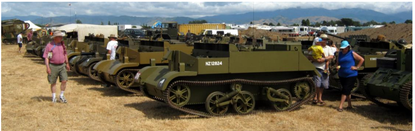
A line up of Bren carriers