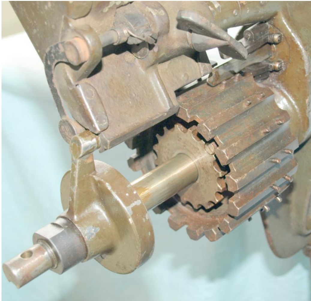
Positioned ready to strip round from hopper and push forward into belt

08/15 Machine Gun. A double ended pick was also included that could be used to open up any pockets in the belt that had been stitched closed or help free up any jams in the machine. In addition to the belt pocket spreader that is integral to the Gurtfuller the cartridge pusher could be replaced with a tool to stretch the cartridge belt pockets of particularly tight belts, the belts would be run through the machine and stretched then loaded afterwards. Another accessory could be fitted to convert the loader to an un-loader, quite a versatile machine indeed! All parts and accessories are serial numbered to the loader.