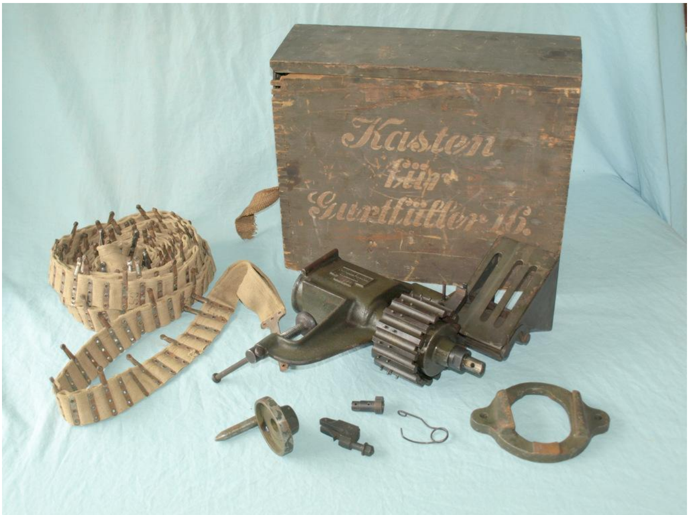
Gurtfuller 16 with 250 round cloth belt, belt pocket stretcher, un-loader attachment, spare gear, spare spring and wall mounting bracket.

Long before the introduction of disposable cloth ammunition belts which surfaced during the interwar period machine gun crews of all nations had to spend a good deal of their time loading belts using an array of belt loading contraptions designed to make the job less arduous (each MG08 for example was issued with 16 empty cloth belts). Logistically it was easier to send bulk crated ammunition to the front and issues with the storage of loaded cloth belts was also a factor as belts that became damp and dirty could shrink causing extraction or fouling issues. The machine pictured here is the German "Gurtfuller 16" (model 1916 belt filler) which was introduced from 1916; one Gurtfuller 16 was issued with each MG08 and 08/15. In typical Germanic style these are quite an engineering masterpiece, beautifully designed and manufactured, supplied in a superbly made fitted wooden case "Kasten Fur Gurtfuller 16" (chest for 1916 belt filling machine) along with spare parts and accessories to keep the Gurtfuller running smoothly and efficiently.