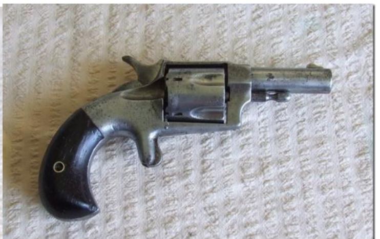
This revolver is marked XL No 4 and has a Patent date of 1871 with a 3 digit serial No