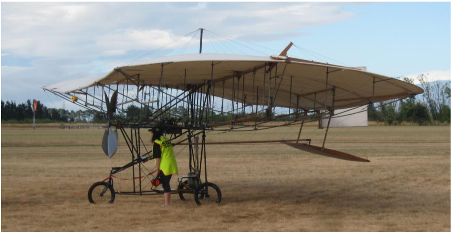
Replica Richard Pearce Flying Machine