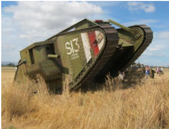
Replica Mk IV Tank