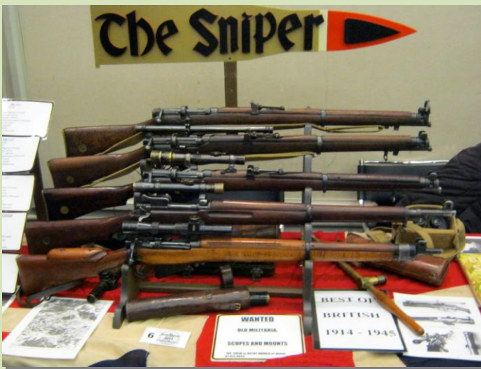
British Sniper Rifles