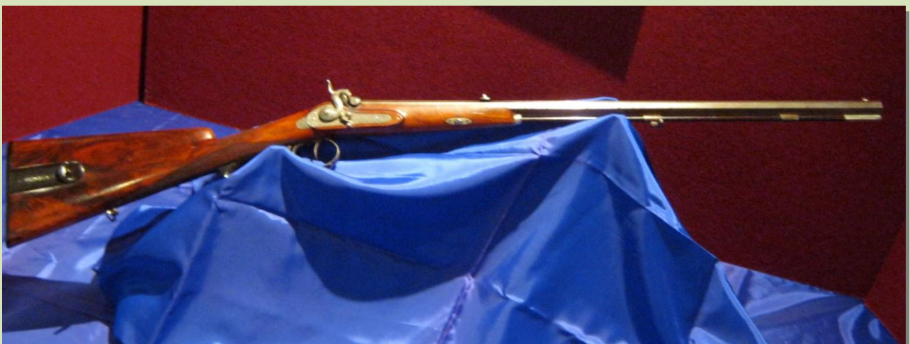
Best Non Military-Princess Victoria's Hunting Rifle