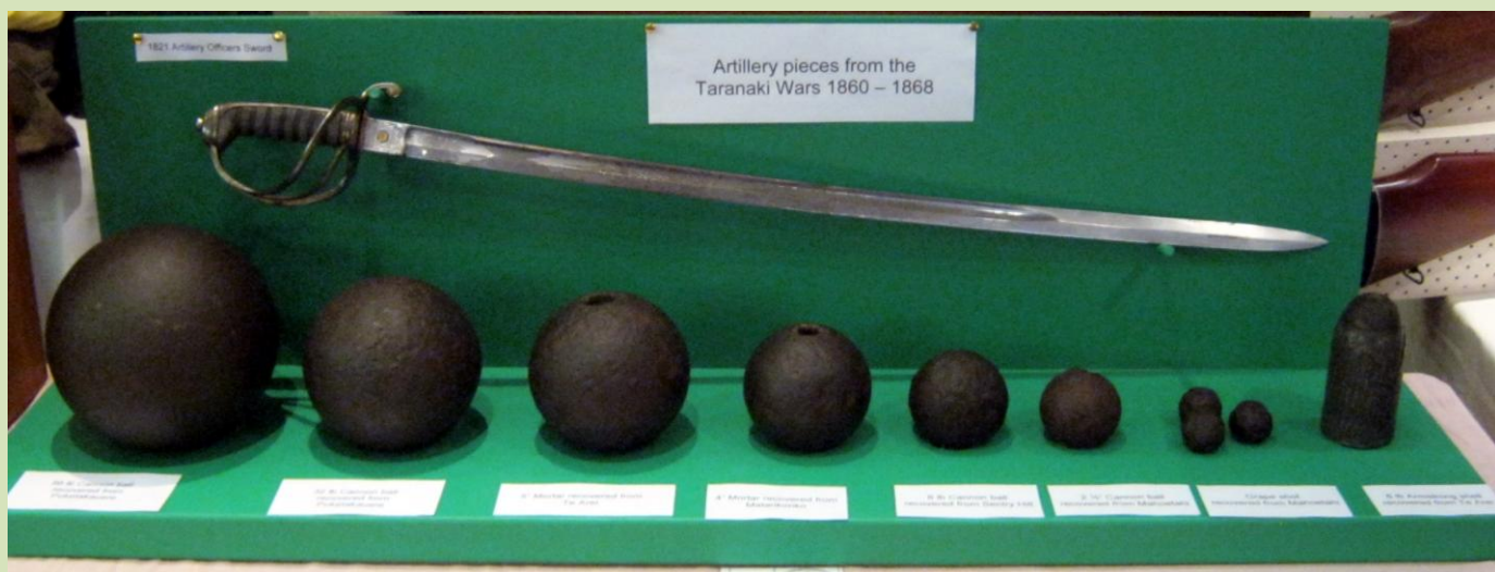
Best British Military