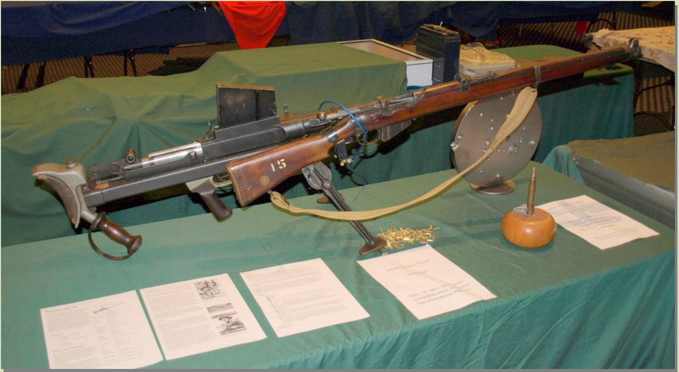
Boys Anti Tank Rifle and .22 Training Aid