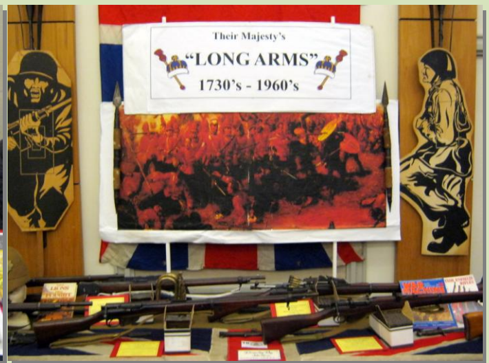
Best Individual & People's Choice