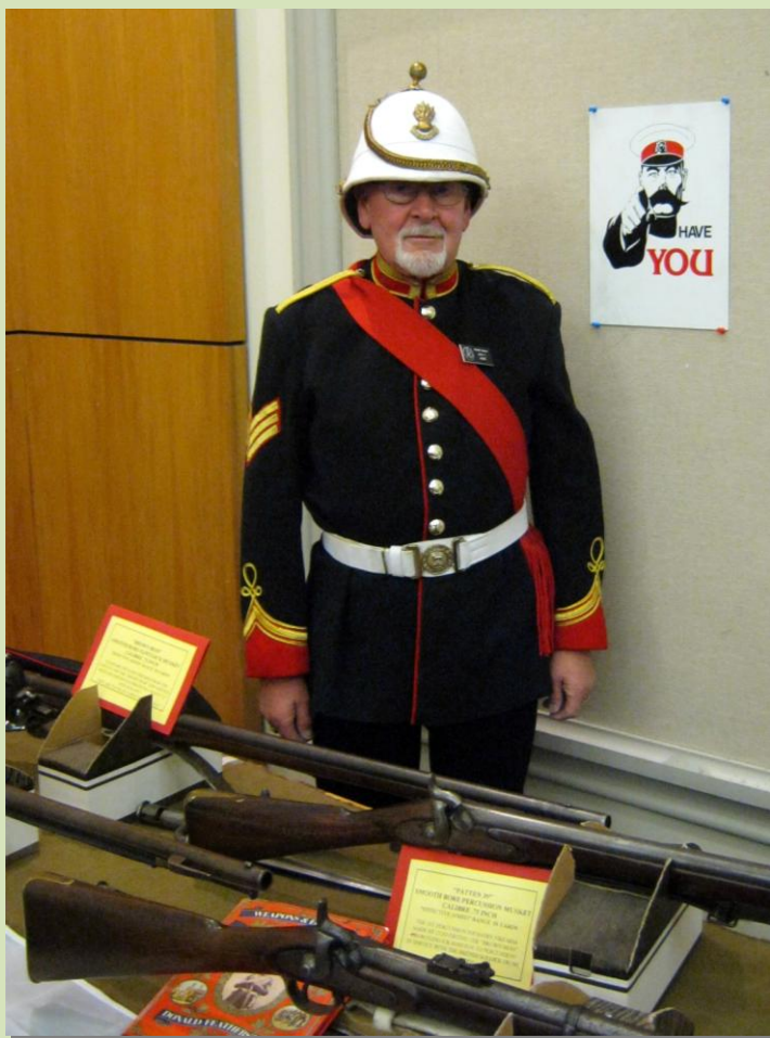
Best Individual & People's Choice