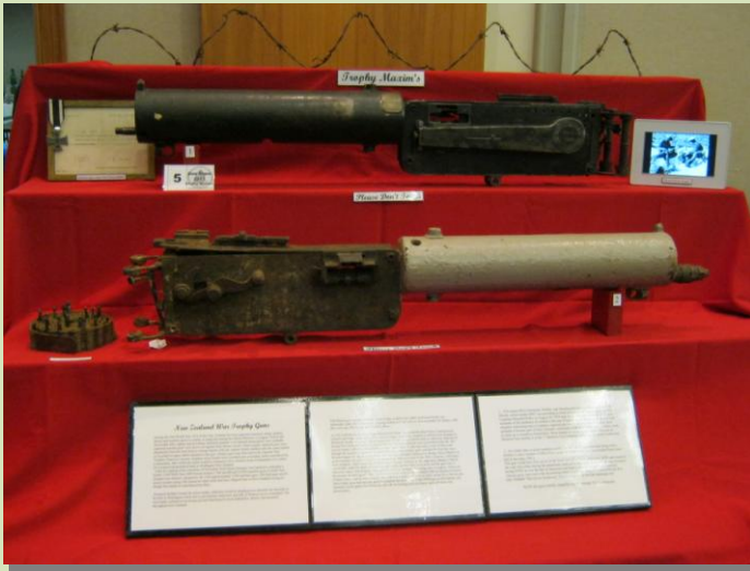
Best Military and Overall- Maxim Guns

One of our smallest Branches put on a first class two day gun show in New Plymouth on the weekend of 5 & 6 November. The whole perimeter of the hall was filled with outstanding displays and the floor taken up mainly with sales tables. It was good to see this event supported by exhibitors from Auckland and central North Island and members attending from as far away as Northland, Hawkes Bay and Wellington.