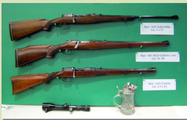
Mannlicher sporting rifles