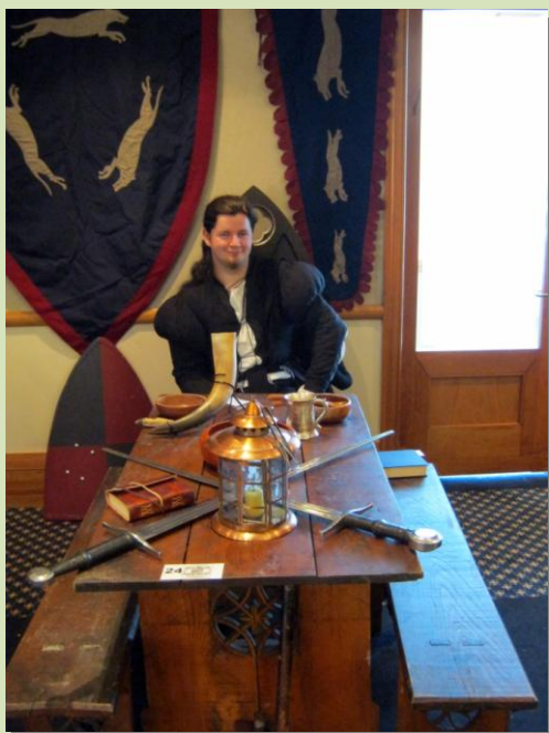
Knight at rest