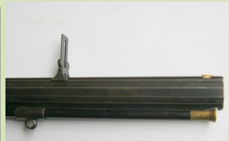
WR sight mounted

More information on the October Mystery Object (above left), from Paulus: "This tool is for adjusting the tension Fuzzee spring pressure for a Vickers Machine Gun in the field, the pointed tool bit is used to open up the Vickers belt to insert missing or jammed bullets, this tool was never used on a Lewis Guns. What's more it is complete".