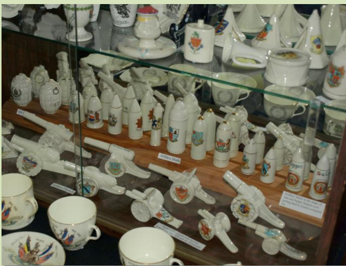
Best Non Firearms