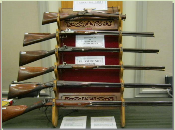
The late Terry Ryan' last display