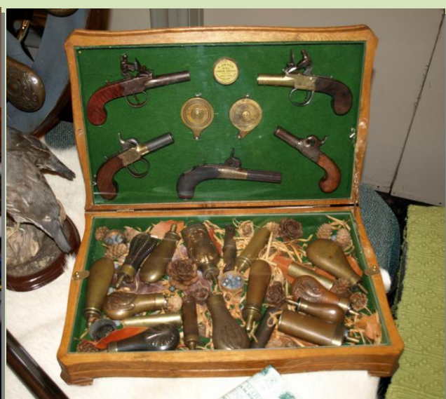
Box Locks & Powder Flasks