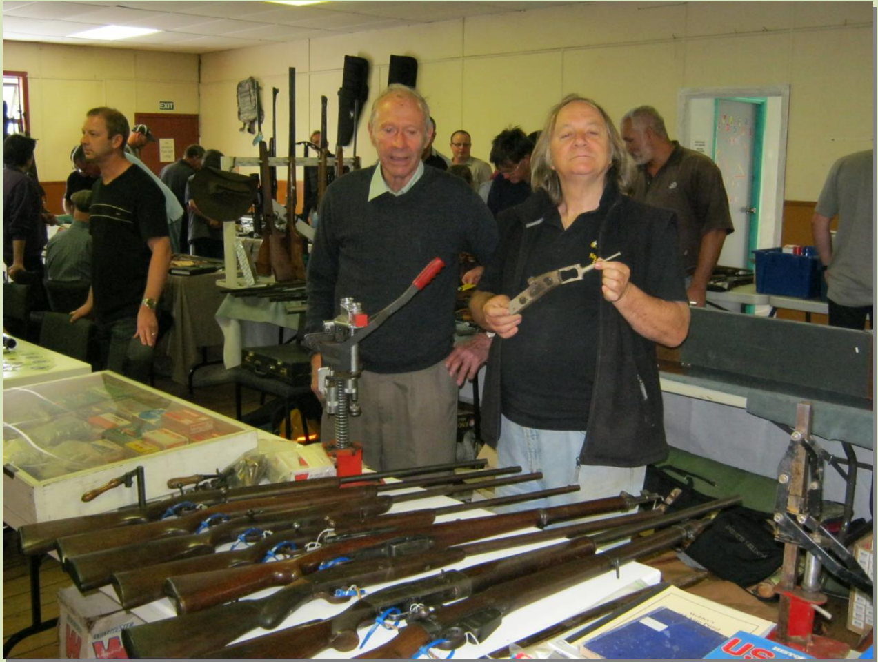
Well known Northland Branch collectors and salesmen