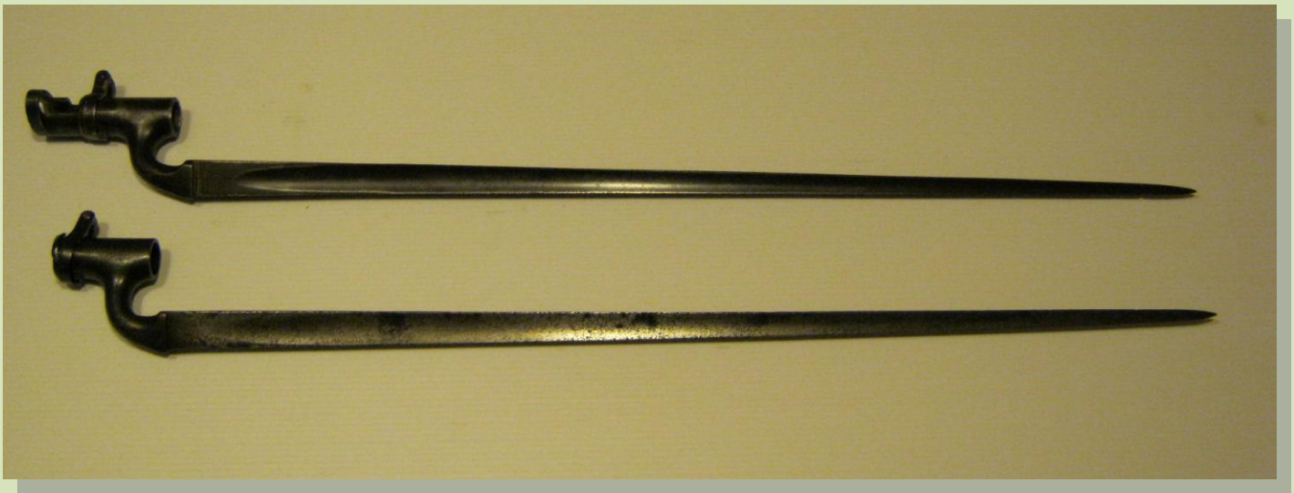
Top: Pattern 1895 Socket Bayonet

My interesting bayonet this month is one I picked up in Otorohanga last November. It is a Pattern 1895 Socket bayonet that has had the rear inch of the socket cut off at the locking ring lip. My first thought was, why has someone ruined a perfectly good bayonet? However, the next day when viewing Leo's collection he showed me another exactly the same, which got us thinking. We speculated that these bayonets had been modified to fit on 310 Cadet rifles, we tried one on Leo's 310 Cadet and sure enough it fitted. Of course if you know of another reason for this modification please let me know.