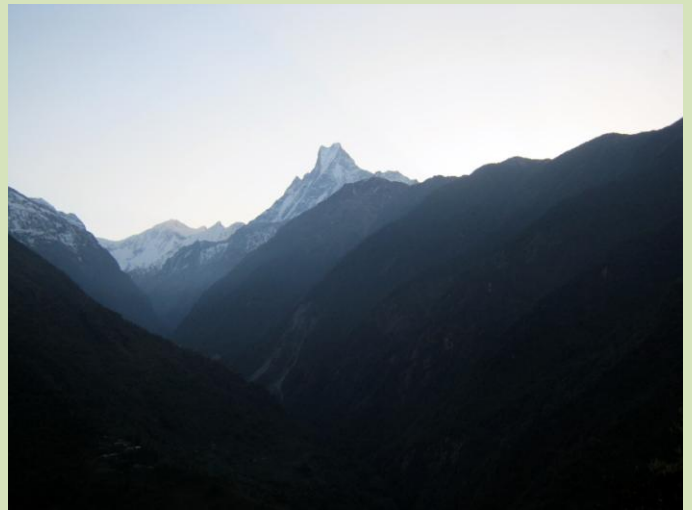
An early morning view of Annapurna South and the Fishtail, Nepal Himalayas