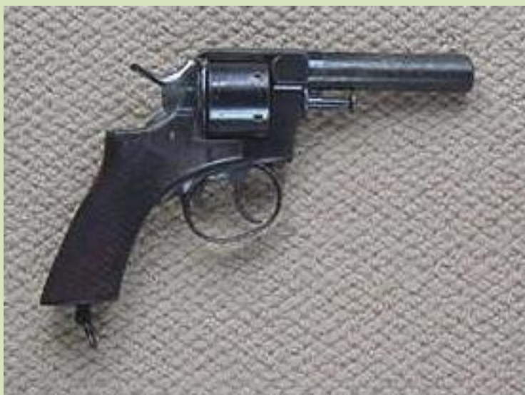
Webley RIC 1 st Model 1867 calibre 0.442