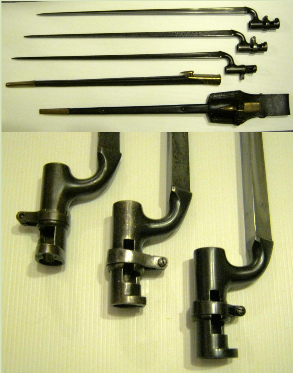
Pat 1895 M E

The bayonet of interest this month is the middle one of the three shown in the photos. This is a Pattern 1876 Martini Henry bayonet that has been bushed to fit the Martini Enfield 303 rifle. The top has been removed from the socket ring to allow it to fit over the higher fore-sight. When fitted the bayonet is to the right of the rifle, rather than below as is normal with the Pat '95 and Martini Enfield.