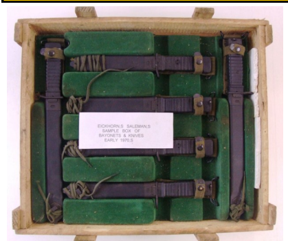
Eckhorn salesman sample

The Auction Convenor, P O Box 14029, Kilbirnie, Wellington 6241, New Zealand Email: info@nzaaawgtn.org.nz