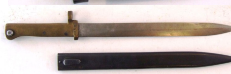
German Brass Ersatz bayonet