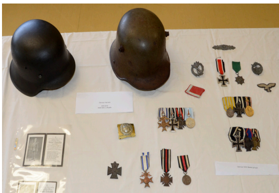
Two German Helmets & Medals from WWII