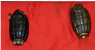
Two Hand Grenades