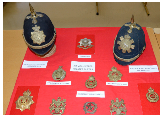
NZ Volunteer Helmet Plates and Helmets