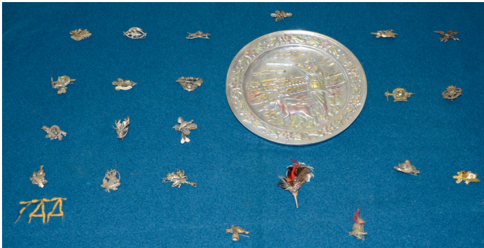
20 plus Hunting Hat badges & Plate with hunting scene