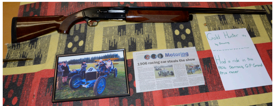
Gold Hunter 12g shotgun by Browning and newspaper clipping