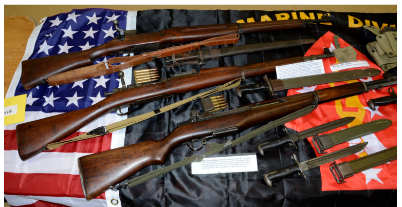
GI Garrand Rifle, 1903 Springfield, and M17 with bayonets