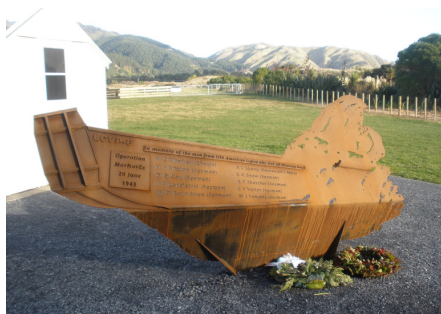
Photo of Memorial at Paekakariki

While the American base in Paekakariki was only in existence for a few years it had an important and lingering impact on the region. Several local place names remain as reminders of this wartime presence. Tarawa Street, for example, commemorates one of the bloodiest battles of the Pacific War which locally based marines fought in directly after the camps were abandoned in October 1943.