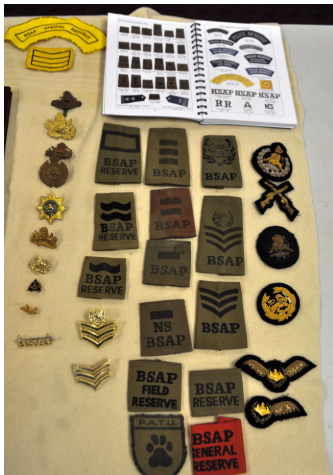
British South African Police badges.