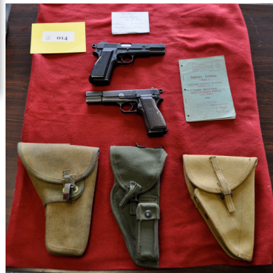
1935 Browning pistols w/ holsters.