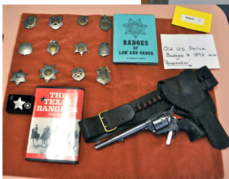
Old US Police Badges, 1896 44-40 Peacemaker.