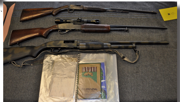
.22 pump gun, 30-06 & 12g shotgun.