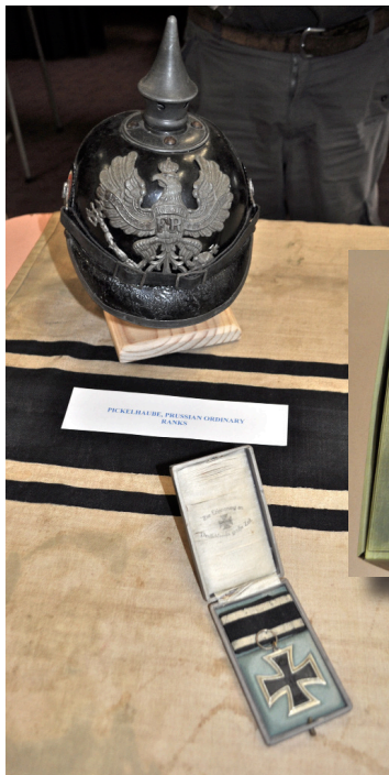
Prussian Helmet with medal.