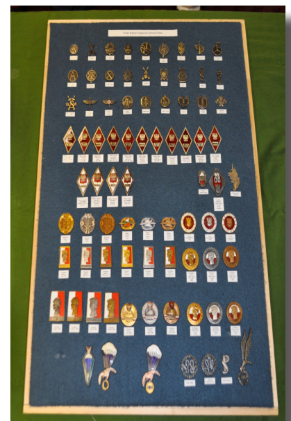
Approx. 70 different Polish branch insignia for service dress