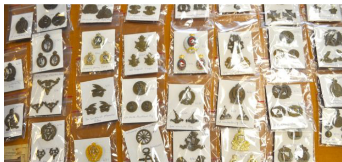
Fighting & Military knives

The Lower Hutt Horticultural Hall: Laings Road, Lower Hutt , New Zealand. Telephone (04) 570 6930 Fax (04) 569 4290 email: contact@huttcity.govt.nz