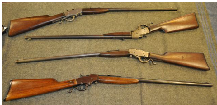
Chicken shooter, Hare shooter, Coyote killer & more...