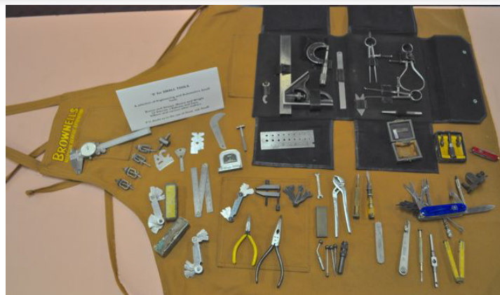
Selection of Engineering & Automotive Small Tools