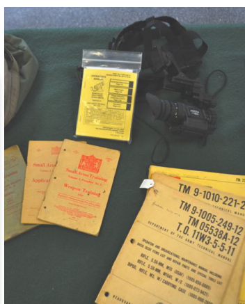
Latest model Sniper Night Vision Sight