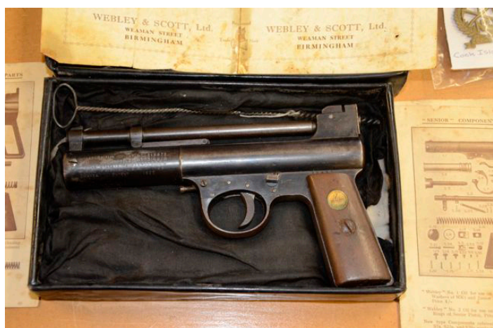
Stock for Auction...