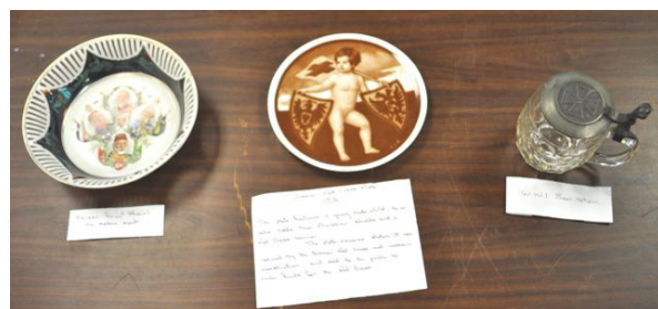
Kaiser fruit bowl, German Red Cross plate & WWI Beer Stein.