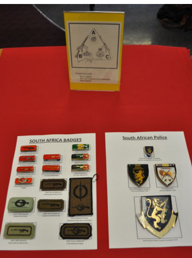
South African Badges & Police Marksman badges