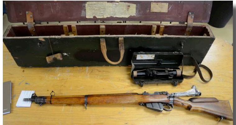
No4 T Sniper rifle with case with scope and accessories