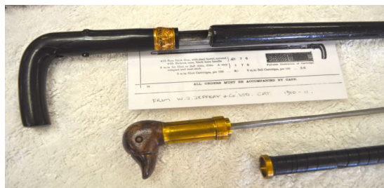
A very special walking stick

Any errors, misspellings or mistakes are intentional and for testing members power of focus and comprehension.