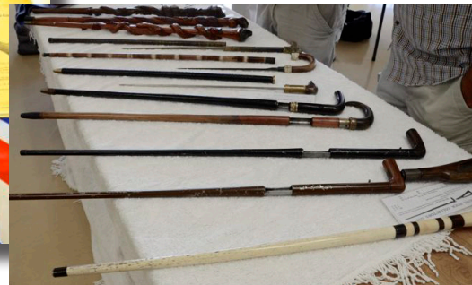
Many Interesting Walking Sticks