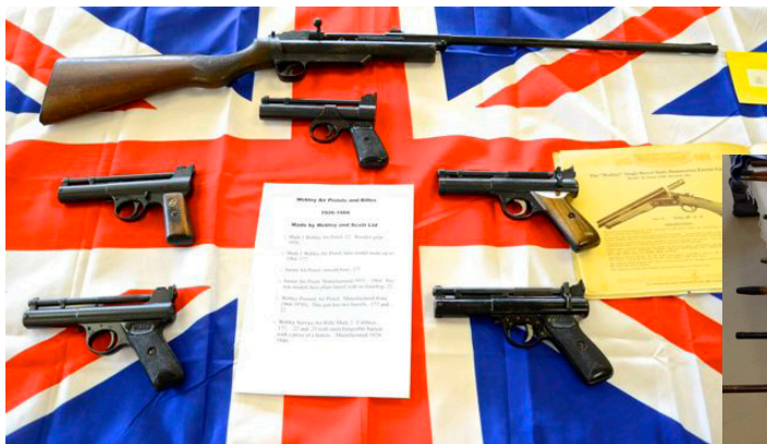
Webley Air Pistols & Rifle