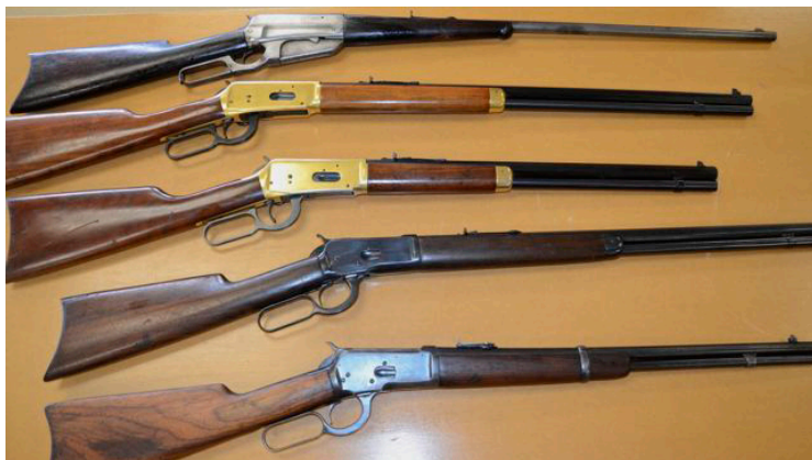
More great Winchester... Mod 1873, Mod 1886 etc.