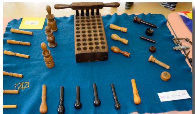
Wooden reloading tools & shell Loading block