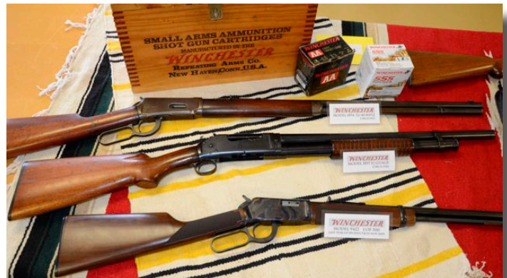
Winchesters, Winchester, Winchester