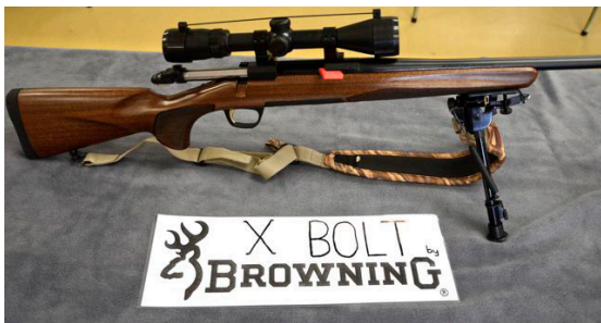
Obvious X Bolt Browning