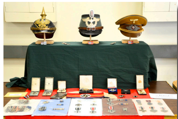
WWI & WWII iron crosses, helmets & hats