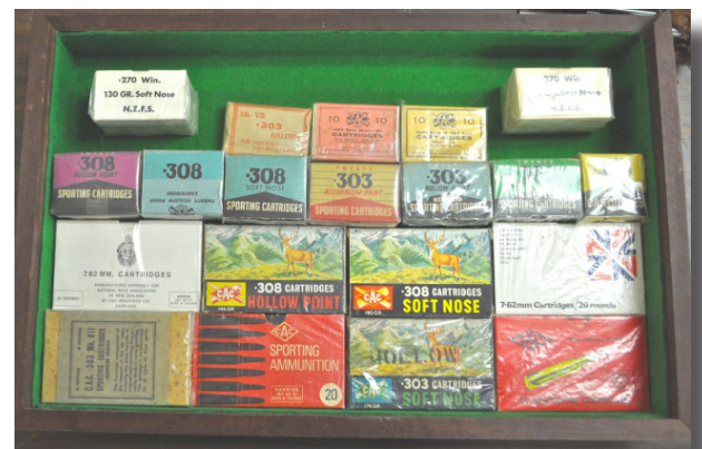
Sporting Ammo packets in 303 & 308