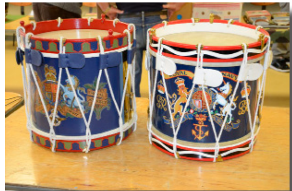
Royal Navy & Royal Airforce Drums