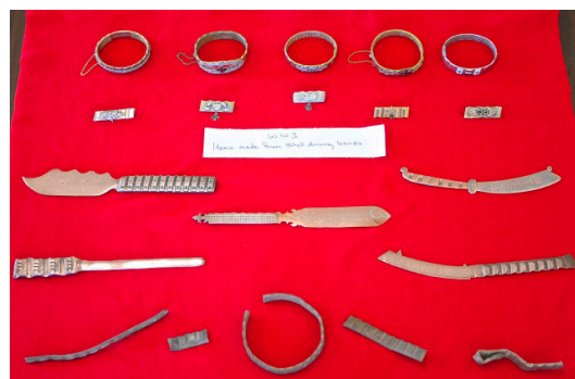
WWI Trench Art from driving bands