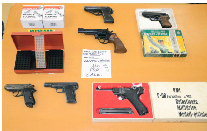
All For Sale