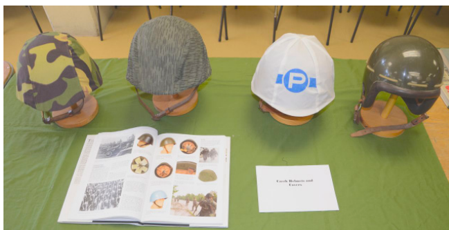
Czech helmets & covers with book on the subject