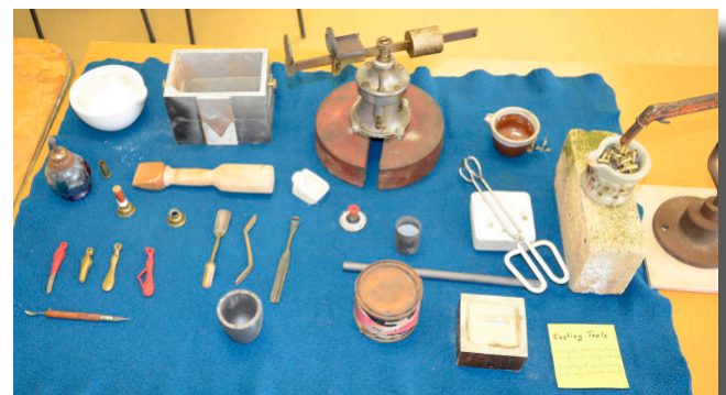
Casting tools, casting brass items from .22 cases