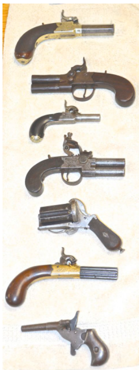
Coat pocket pistols