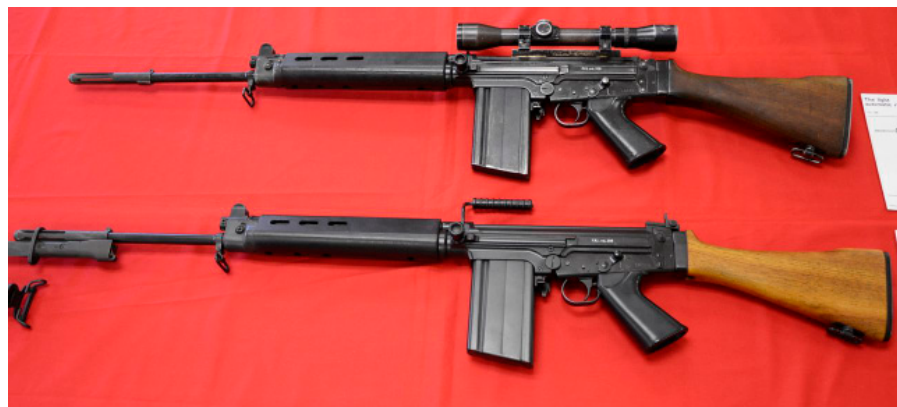
Civilian sales of FAL rifles, 1 with scope used for deer culling.