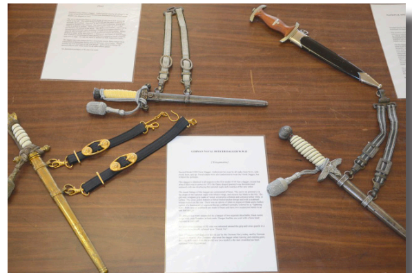
German daggers, naval, Socialist Motor Corps.