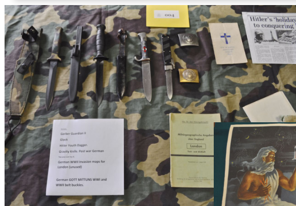
Gerber knives, Glock, gravity knife, German WWII belt buckles.