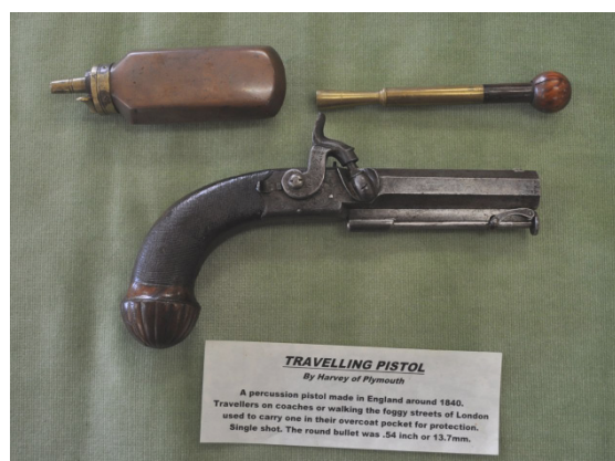
Traveling pistol by Harvey of Plymouth.