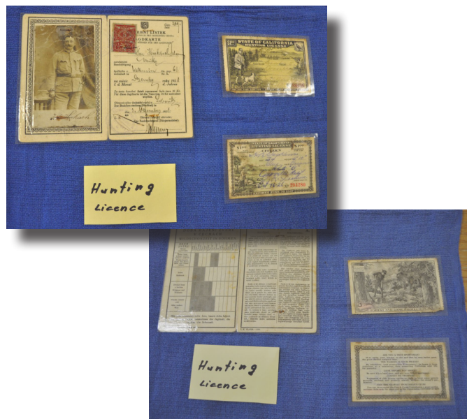
Front & back views of Californian and German Hunting licences from the early 1900's.

Please let Scott know if you are interested in going as we will be requiring a deposit for the air fares around early August in order to confirm seats. There will be a spread sheet at the meeting to fill in if interested.