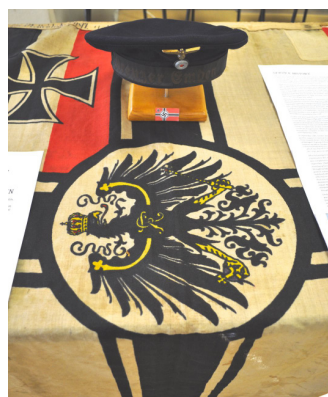
Navel cap & flag