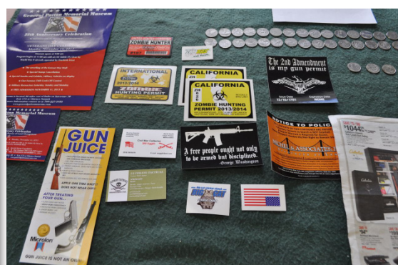
Items from America.

Any errors, misspellings or mistakes are intentional and for testing members power of focus and comprehension.