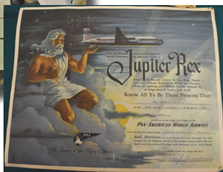
A 1950's certificate for crossing the date line.