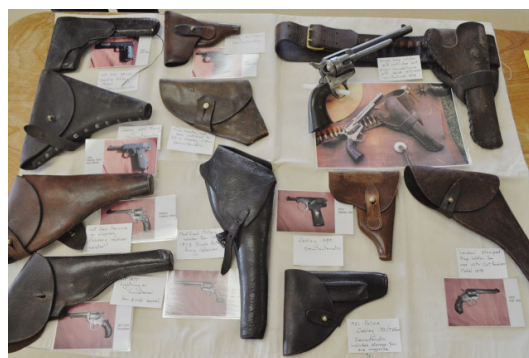
A variety of Holsters - A very nice display.