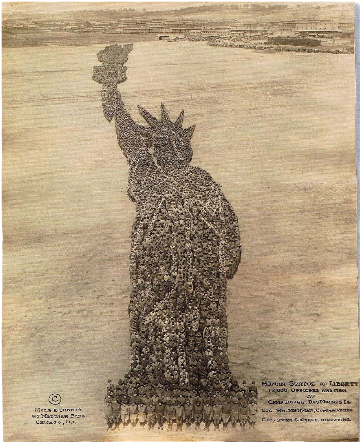
STANDING TALL Titled "Human Statue of Liberty," this image was taken at Camp Dodge in Iowa and used eighteen thousand men.

This INCREDIBLE picture was taken in 1918. It is 18,000 men preparing for war in a training camp at Camp Dodge , in Iowa