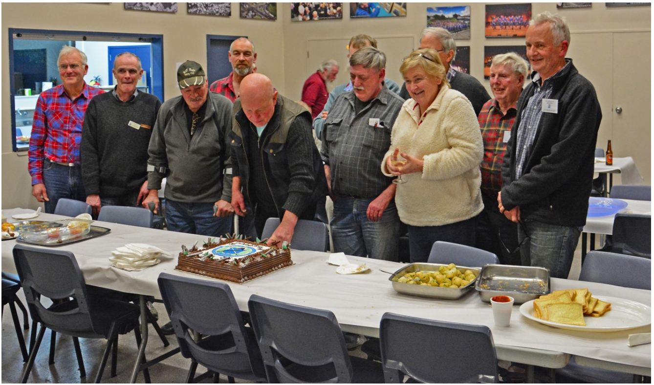
Auction 2014—30 years Cake