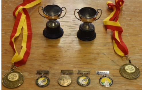
Hutt Valley Gun Club Medals and cups.