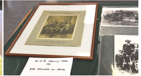
W.C.R Shooting Team 1911