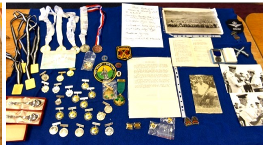
Shooting medals, RNZAF-Blenheim plus other clubs