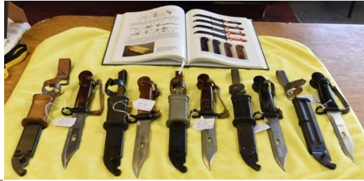
Soviet Bayonets, Hungarian, East German

The theme letter of N and O brought out a few items and the Sporting theme with items from all shooting disciplines was certainly well represented. Not a lot of people there with Ted's auction up the road but an interesting meeting none the less.