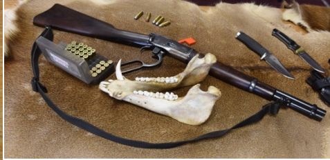
VZ 33 Small ring Mauser, .270 cal built by Din Collings plus Pig Gun, 44-40 Rossi, cut down by Alan Carr, laid out on Sika stag and hind skins