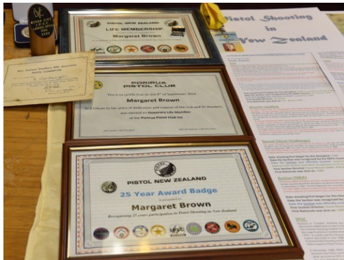
Pistol Shooting in NZ. Certificates, Medals and photos of IPSC shooting