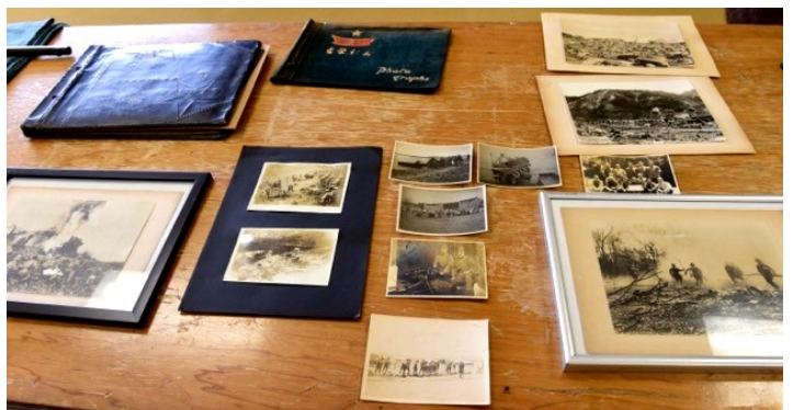
WWII Photos take by Japanese. Very rare to find photos taken by the Japs.