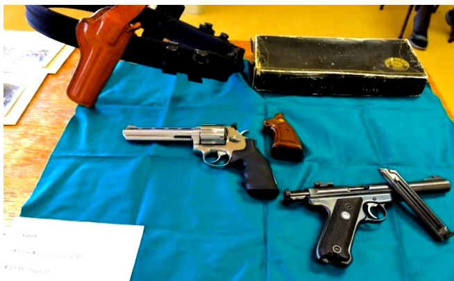
Stainless Taurus-.38/.357 Revolver plus Ruger Mk II Target .22