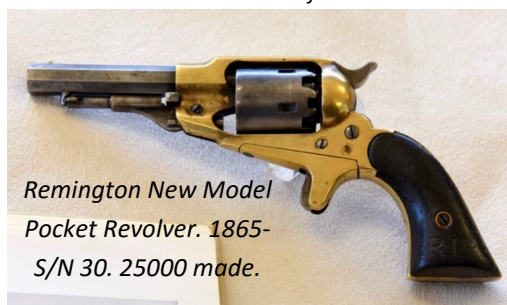
Remington New Model Pocket Revolver. 1865- S/N 30. 25000 made.