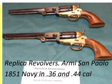
Replica Revolvers. Armi San Paolo 1851 Navy in .36 and .44 cal

Excellent turnout. Over 45 members. 26 displays. Brilliant! Theme of Cadets and Junior Forces saw some interesting items. R and S letters as the letter theme.