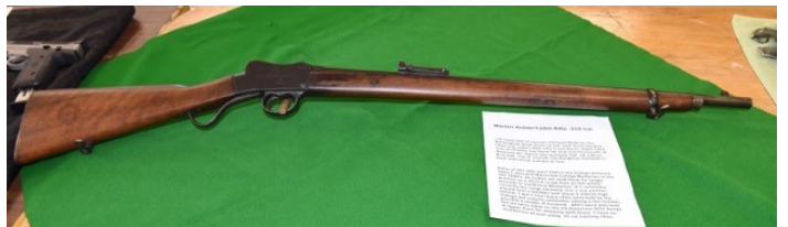
Martini Action Cadet rifle in .310 cal. Marked Commonwealth of Australia