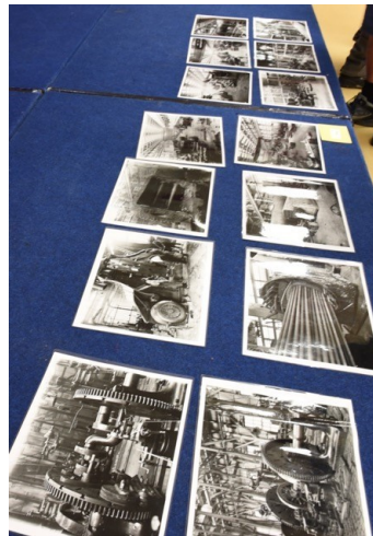
Railway Workshops photos