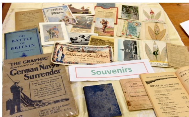
Souvenirs of the Great War