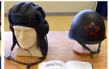
Post War Soviet Dissolution Helmets