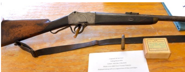
Cogswell & Harrison Falling Block .450 cal rifle (No 2 Musket) 1885