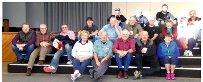
The hardy souls who wrapped and processed the postals on the Monday

Our annual July auction was held last weekend and once again it turned out to be a huge success. Bidding was very competitive with very few items passed in. If prices are anything to go by then it bodes well for the future of collecting. Prices for bayonets was very strong and we also achieved $8200 for a Browning pistol and $16500 for a Luger. A lot of the out of town collectors took advantage of our social meal on Saturday evening and spent time catching up with fellow collectors! after all, talking to fellow collectors and sharing information is what it's all about. Once again the catering was superb, the computers and security ran like clockwork, and the postal wrapping went well. The branch has received great feedback from collectors who attended and it's a credit to the branch and its members as to what we have achieved. I would like to thank all those who took the time to help make this a fantastic branch event. Steve