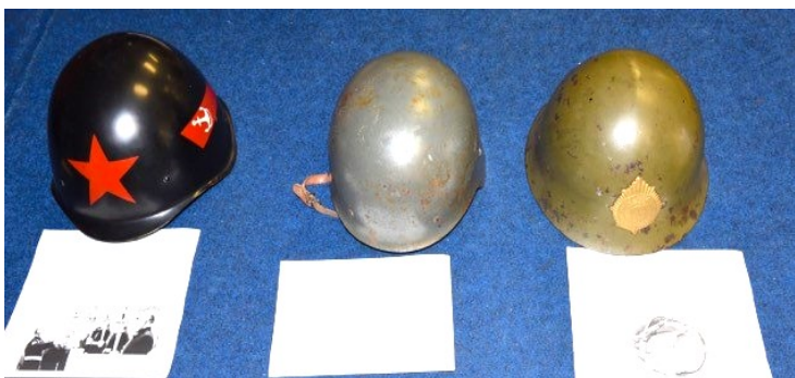
Helmets: Soviet Parade; Rare Spanish M21; Siamese (Thailand)