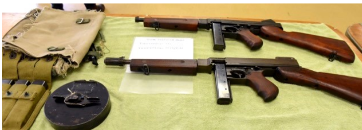
Sub Machine Guns. Thompson M1 & Thompson M1928 A1