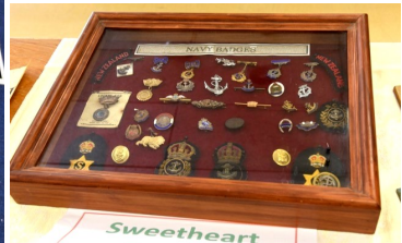
Naval Sweetheart Badges