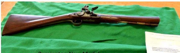
Remington New Model