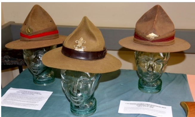
Lemon Squeezers. 11th Taranaki—C.1914-20; Bot Scout Cadets C. 1910-1921; 17 Ruahine Made in UK, C.1917-21.