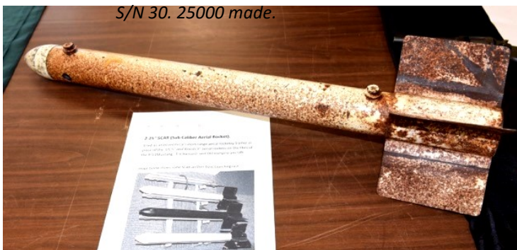
Rusty Rocket Requiring Restoration. 2.25" Sub cal Aerial Rocket